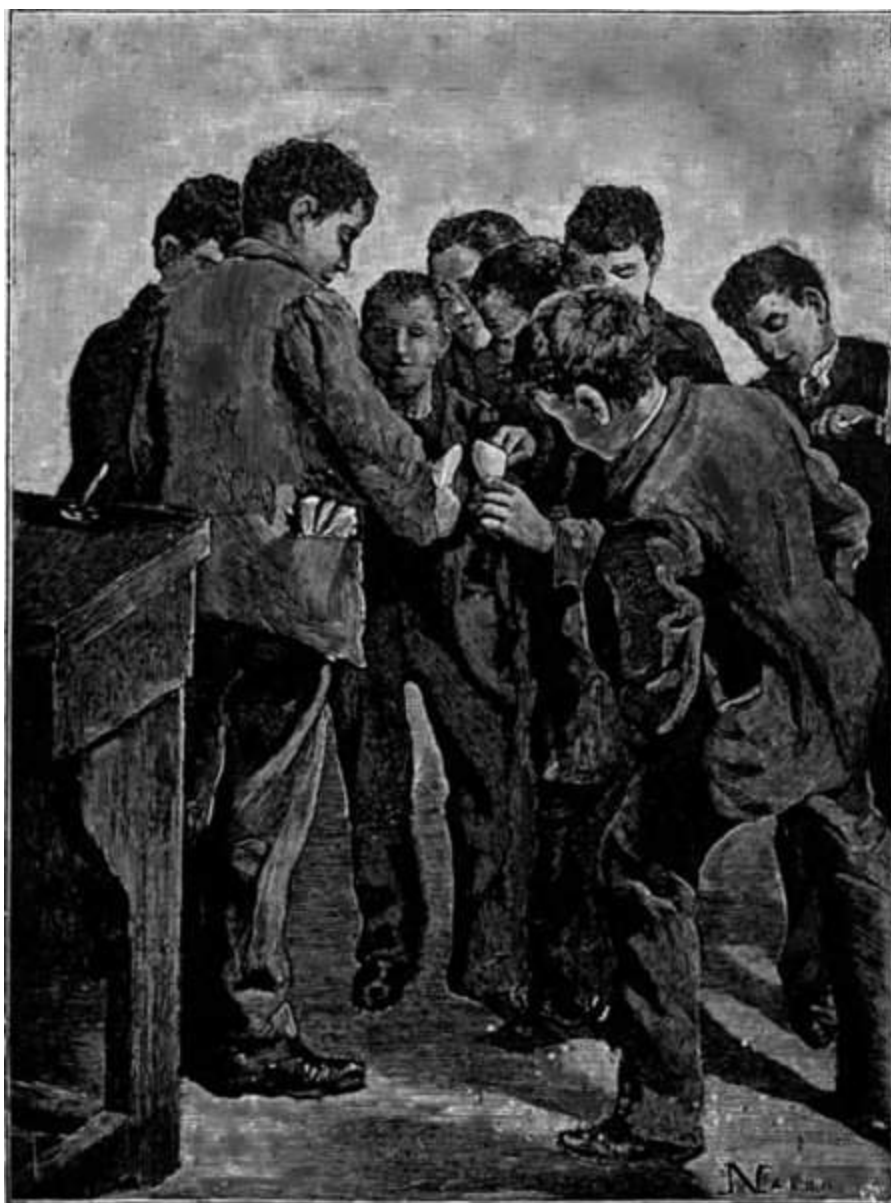
“THE BOYS HAD DAUBED THEIR HANDS WITH RESIN.”

In order to climb the more easily, all the boys had daubed their hands with resin, which they call colophony, and as a matter of course it is that trader of a Garoffi who provides every one with it, in a powdered form, selling it at a soldo the paper hornful, and turning a pretty penny.